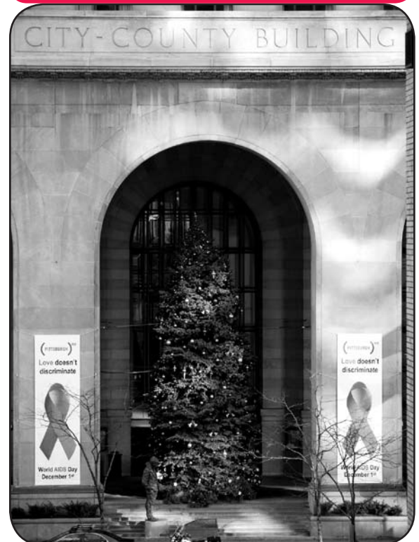
The City-County Building's portico was graced by World AIDS Day banners.